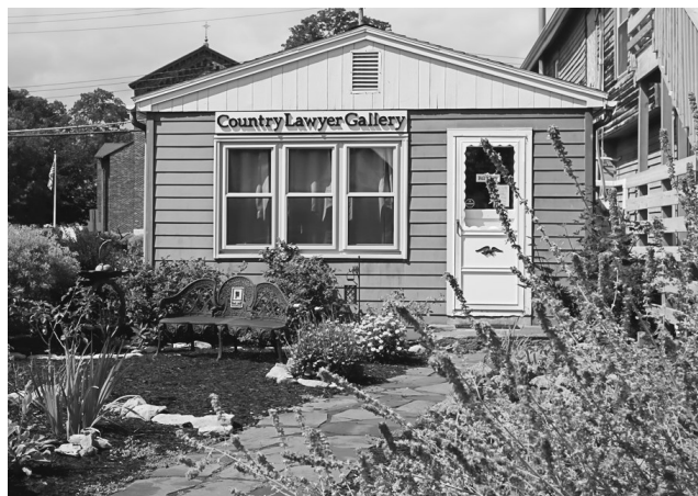
Back garden entrance of the Country Lawyer Gallery of the Arts

When you visit the gallery, you can feel the energy throughout our shows coming from the distinct mix of art created by those who have been at it for a long time and art from those who might even be showing for the first time. Personally, I like to walk through our exhibits when we are not busy and just soak it all in. It's energizing, inspiring, humbling and satisfying all at once. A fine example of this is shown in our current exhibits - "Walk" and "Plein Air with a Twist". Come in and see what I mean!