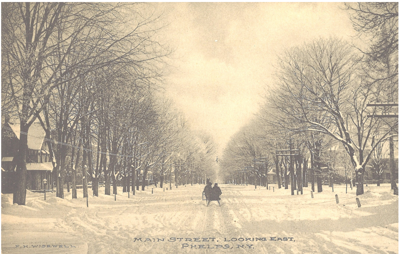
The sleigh has just passed the corner of Exchange Street. The Howe House is coming up on the left. Postcard circa 1910.

from the President, Board of Trustees, staff and volunteers at the Howe House Museum