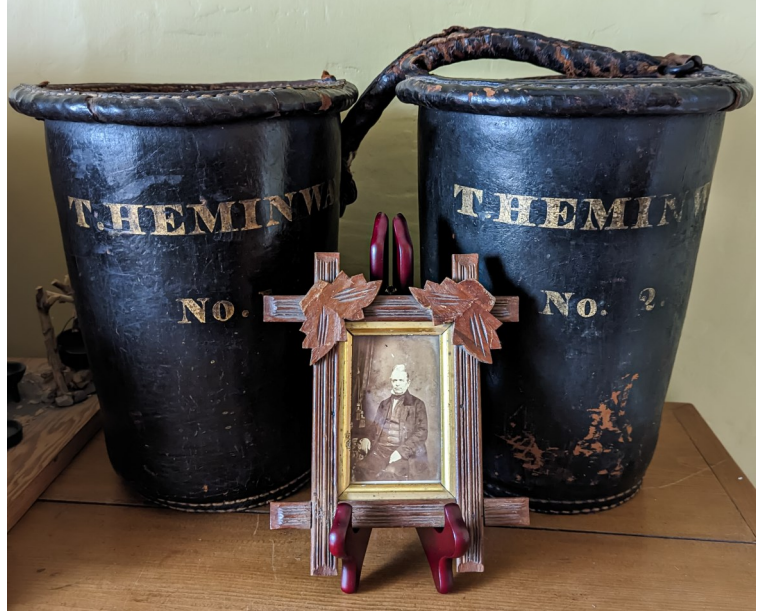
Portrait in photo is Truman Heminway.

Fire buckets would have been kept on hand in the house for water in case of fire, a constant threat due to the use of fires for heating and cooking. They were also there to aid firefighters if need be and were stenciled with the name of the homeowner, as was the custom, to assure they were returned.