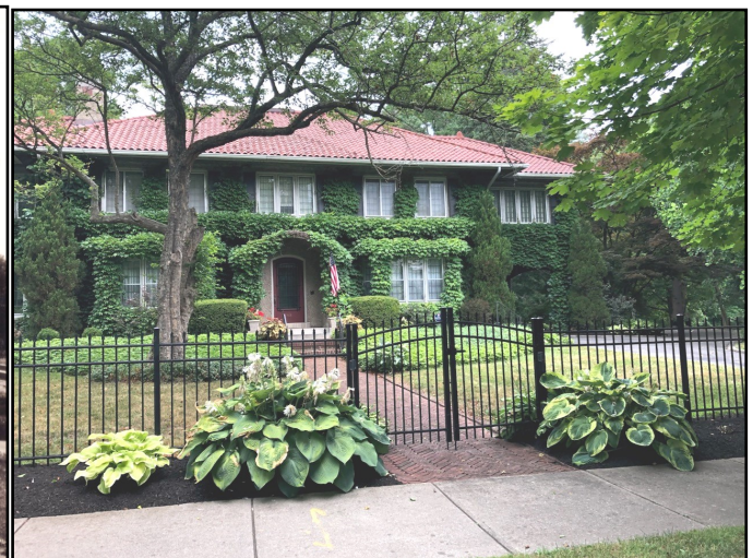
48 Main Street - 100 years old