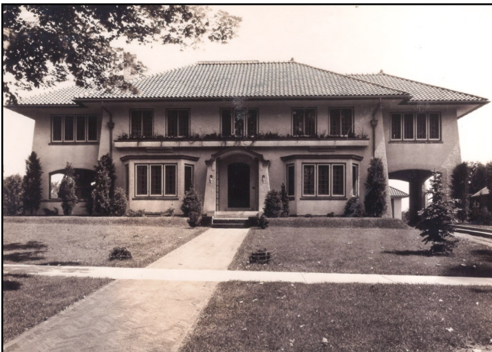
103 East Main Street - built 1923