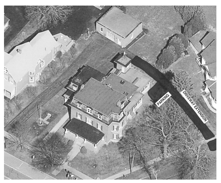
Aerial view of the Howe House from OnCor Property Map

Please see the map below of the driveway extension.