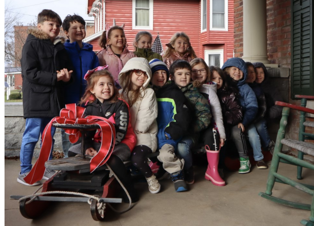
All smiles for a class photo on the bobsled displayed on the Howe House front porch.