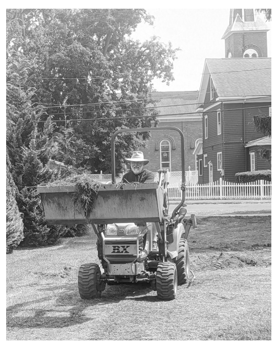
Ron Grube digging out the driveway extension