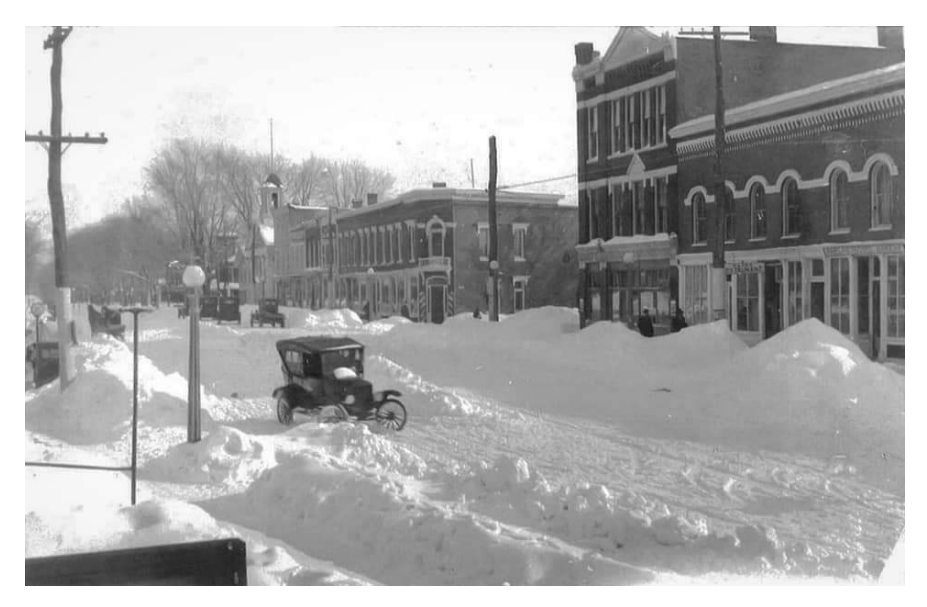
February 3, 1925 Snowed in on Main Street