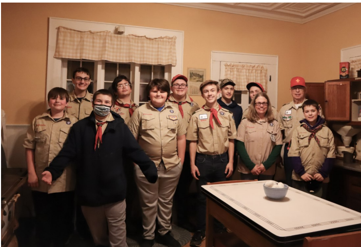
Phelps Boy Scout Troup #46