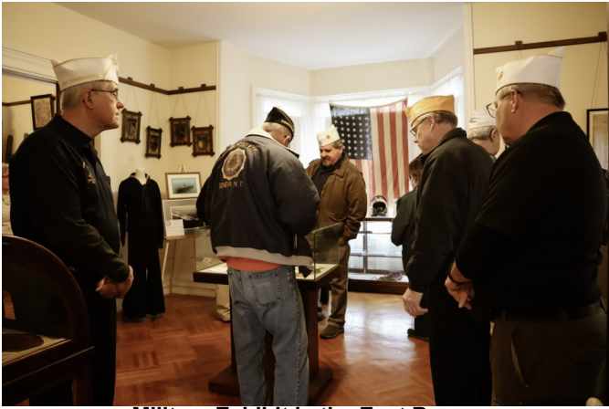
Military Exhibit in the East Room.