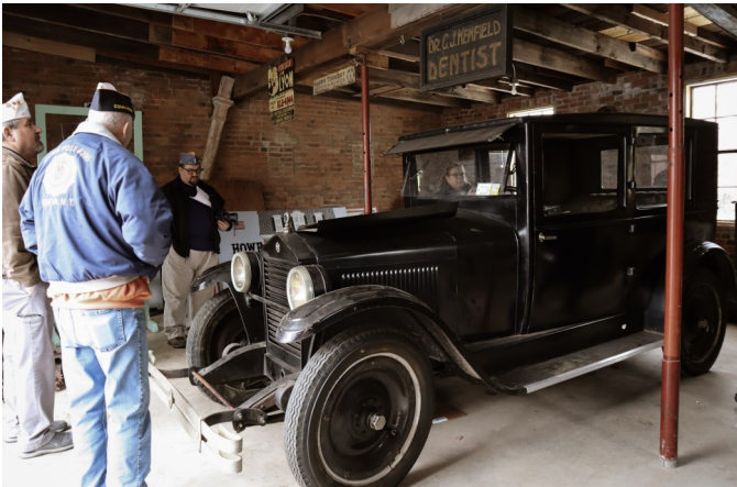
Viewing the 1924 Essex in the Carriage House.

The PCHS would like to thank the Seeley B. Parish Post #457 for their continued support since 1969 when our first museum was in the downstairs of their building.