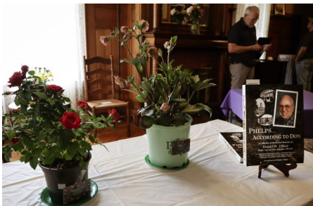
Outdoor plants for drawing - donated by Windy Hill Farm