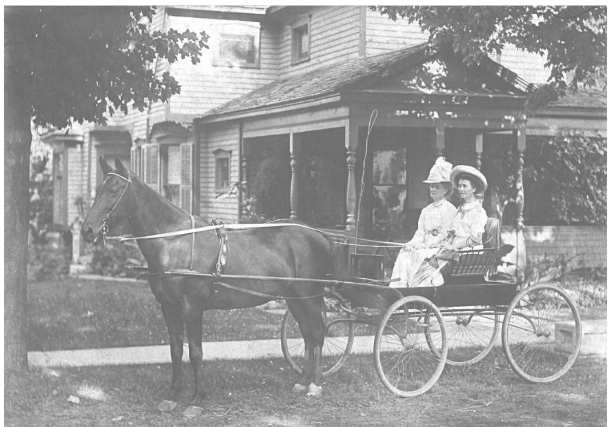
Circa 1911 - photo taken in front of 33 Church Street ( now #27 )