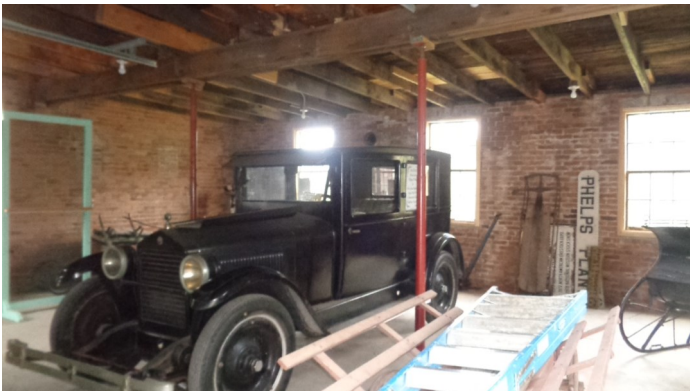
Carriage House before ceiling painting