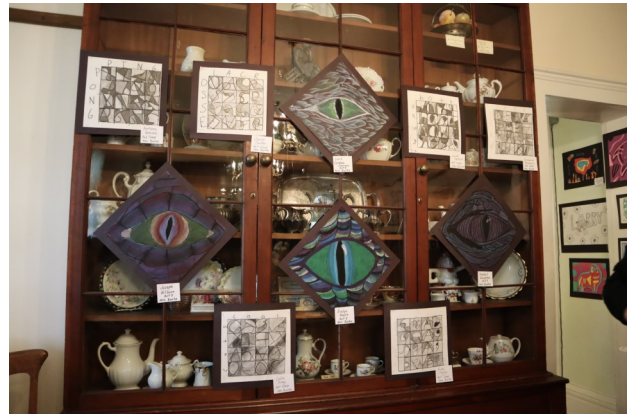
Midlakes students art work on display in dining room