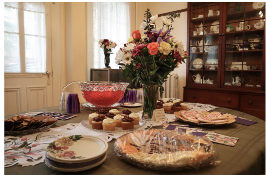
Refreshment table in dining room with floral bouquet donated by Sandy's Floral Gallery