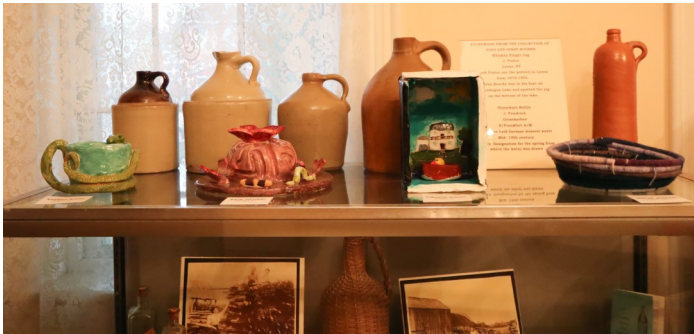
Midlakes students ceramic art on display in dining room.