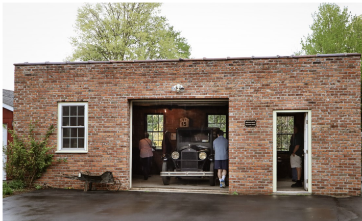
First viewing of Transportation Exhibit