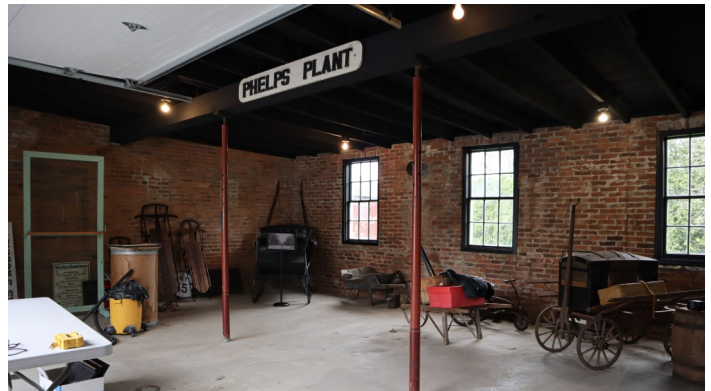
Carriage house after ceiling painting