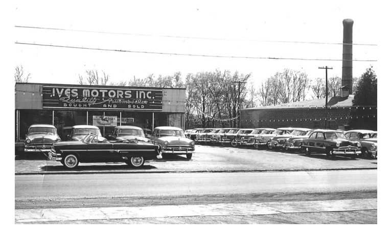
Ives Motors Inc. on West End of Main St 1954

Photo left: Ives Motors Inc., 261 Main Street. Later Tyman Ford, and since 1995 the Blue Ribbon Smokehouse Restaurant and Bakery.