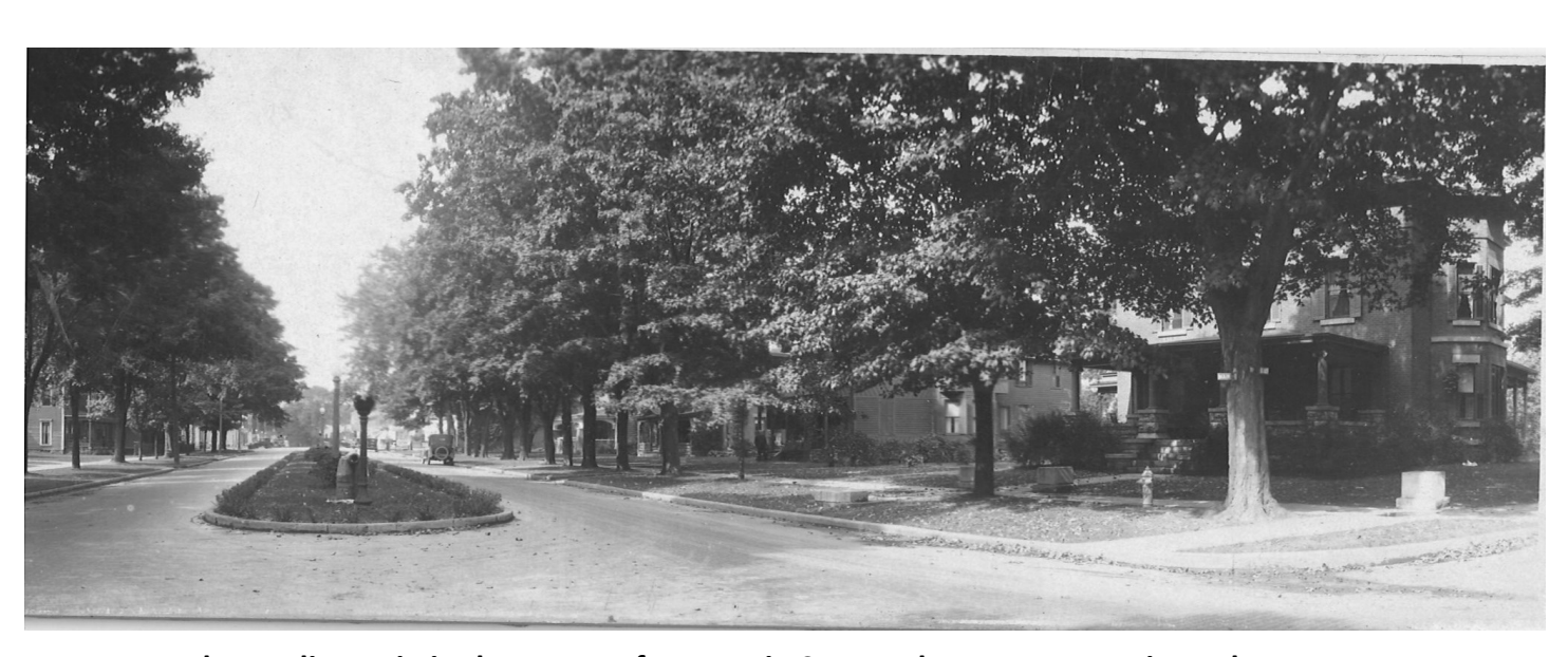
The median strip in the center of East Main Street. The Howe House is on the corner.

Photo below: The median strip in the center of East Main Street ran from North Wayne Street to Exchange Street where a Civil War cannon sat. Installed in the mid 1920s, the median was removed in September 1946 and replaced with asphalt pavement.